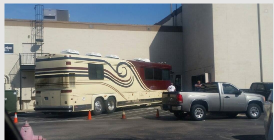
"The Bus" at Arlington Music Hall.