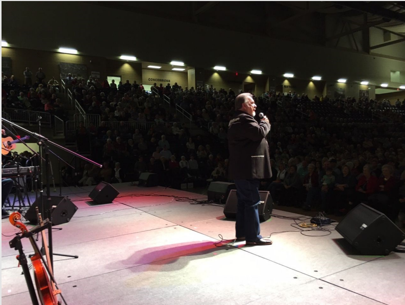
Gene Watson on stage at the Mill Town Music Hall in Bremen, Georgia, March 2016.