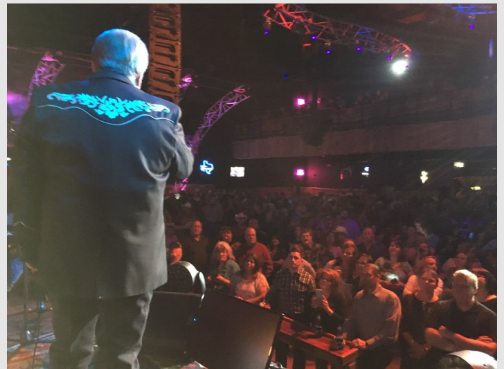
Gene Watson at Stampede Houston in April, 2016 in a co-appearance with Tanya Tucker.