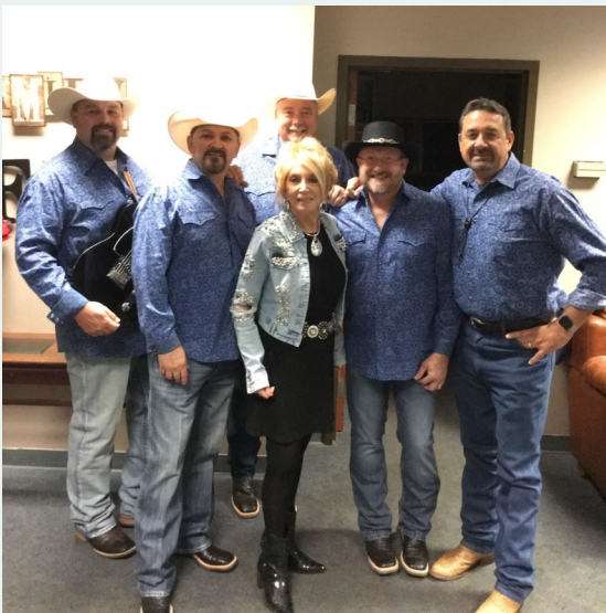
The Farewell Party Band enjoyed backing up their friend, Grammy winner, Jeannie Seely, at the Country Tonite Theater in Pigeon Forge, Tennessee.