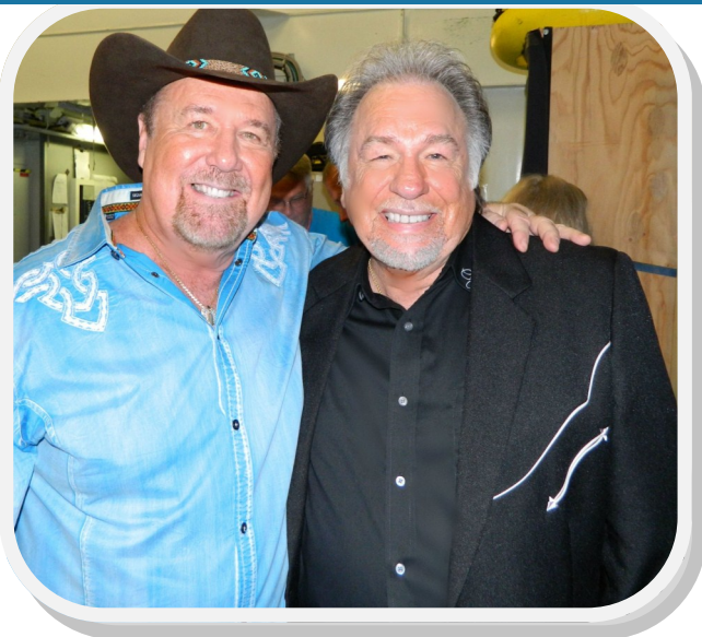
Gene Watson with Johnny Lee