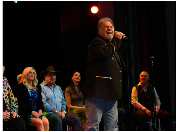
Gene Watson sings his most requested song: "Farewell Party"