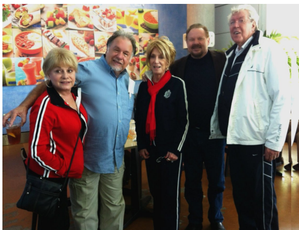
At the airport, heading home!