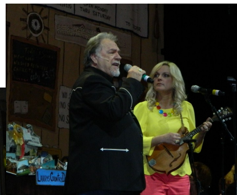
Gene Watson and Rhonda Vincent sing "Will The Circle Be Unbroken" on 'The Diner' show.