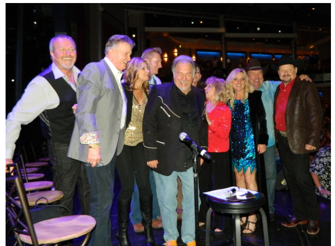
A group photo after the final show