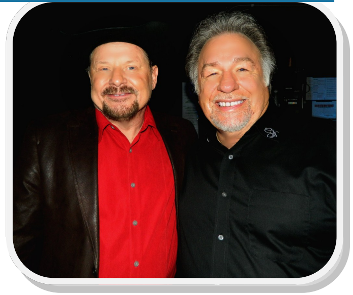
Gene Watson with Moe Bandy