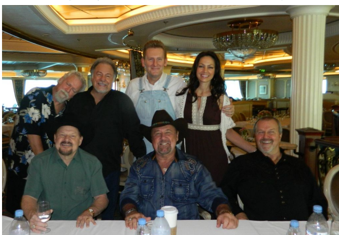
Front: Moe Bandy, Johnny Lee, Ronny Robbins. Back: T. Graham Brown, Gene Watson, and Joey + Rory.