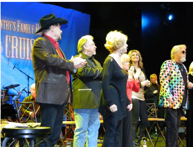
The final CFR show