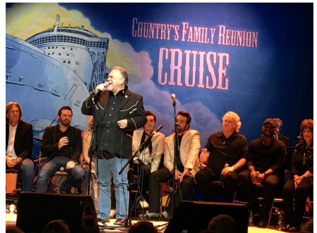
Gene Watson hits all the right notes for his #1 hit, "Fourteen Carat Mind".