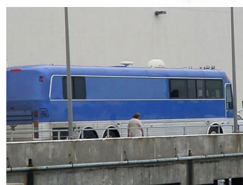
1997 Blue Eagle