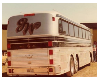
1980 Silver Eagle