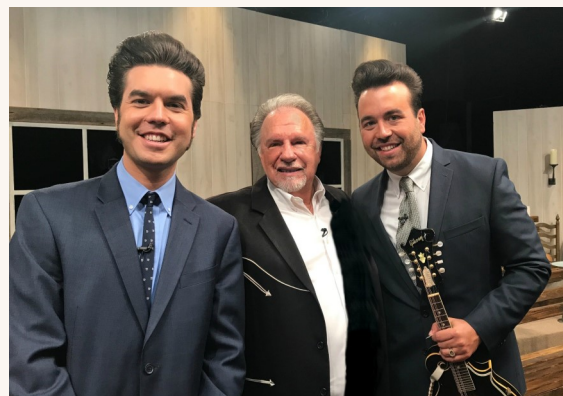
If you haven't yet discovered The Malpass Brothers, you are missing out! These super talented & super nice young men play Real. Country. Music.