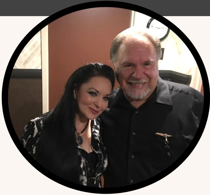
Gene and Crystal Gayle visited backstage, talking about the days when they toured together. Crystal is of course the younger sister of Loretta Lynn!