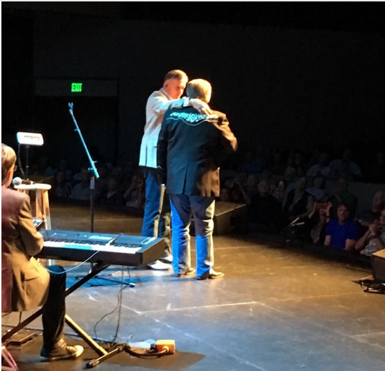
Bill Anderson & Gene Watson at the Montgomery Performing Arts Center, Montgomery, AL