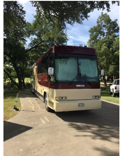
"The Bus" at Stephenville, TX