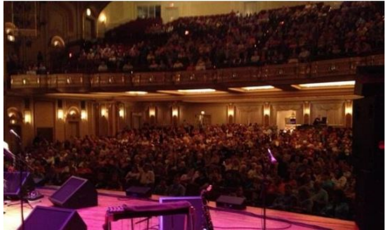
Tivoli Theater, Chattanooga, Tennessee