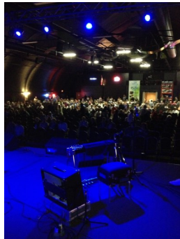
Choctaw Casino Grant, Oklahoma