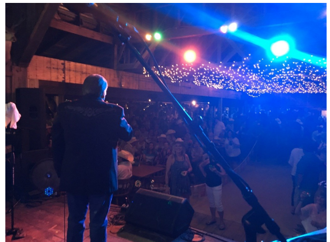
It was a full house at the Freiheit Country Store in New Braunfels, Texas!