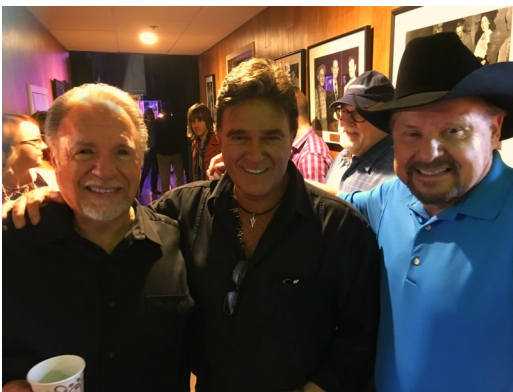
Longtime friends, TG Sheppard and Moe Bandy posed for this picture backstage at the Ryman.