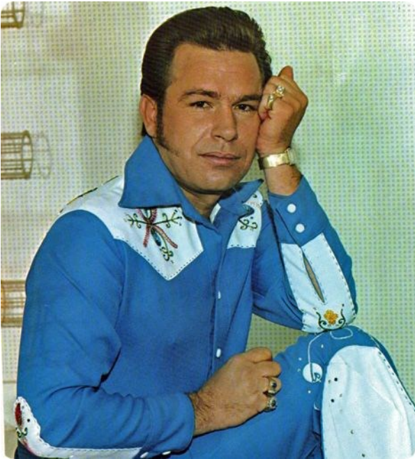
Early Capitol Records publicity photo from around 1975/1976. This custom suit was made in Houston, TX.