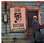
"Just At Dawn"