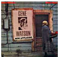
"Most Of All Why"

A: Well he didn't come just to see me but George Jones was the headliner one night for a club called The Wells Fargo in Houston and I was the opening act. Jones always brought two guitars on stage and that night he broke strings on both of them so he had to borrow my guitar. I was thrilled to see him up on stage wearing my guitar strap and using my guitar. I used to have a photo of that but not sure where that is now. He had a song he'd written called "Tonight I Just Don't Give A Damn" that didn't do well on the radio charts but today is considered a classic. I made him sing that song twice that night.