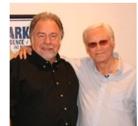
"Tonight I Just Don't Give A Damn"

https://www.youtube.com/watch?v=0q223jSH89U