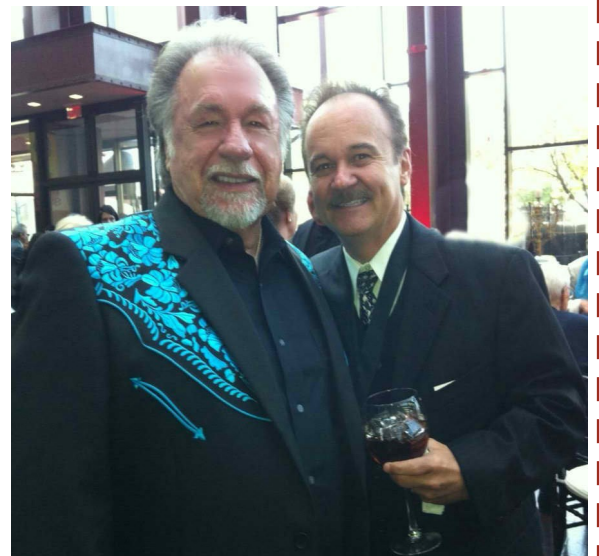
Gene Watson and Jimmy Fortune