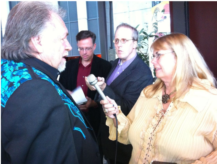
Interviews were a part of the evening for the artists.