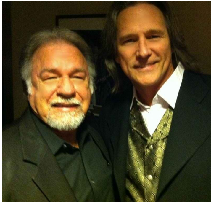
Gene Watson and Billy Dean snapped this photo backstage at the Grand Ole Opry on November 13, 2012.