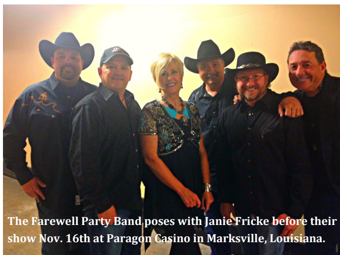
The Farewell Party Band poses with Janie Fricke before their show Nov. 16th at Paragon Casino in Marksville, Louisiana.