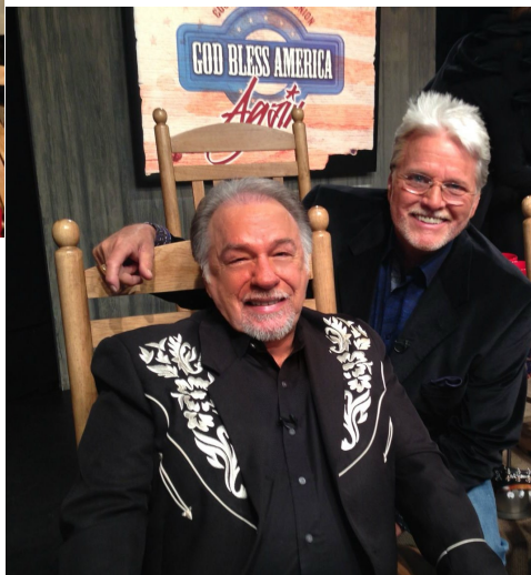
Right photo: Two great country voices: Gene Watson and Con Hunley