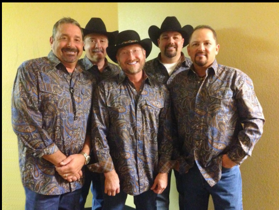
What a handsome and talented group – The Farewell Party Band!