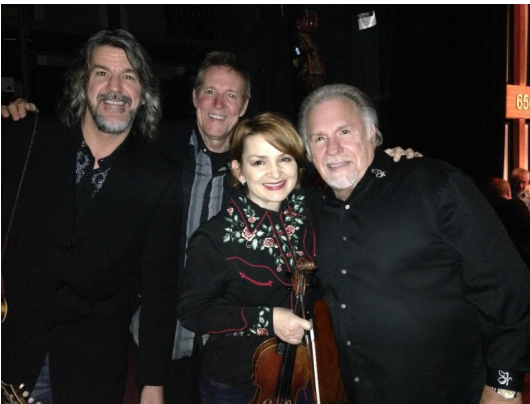
Bluegrass greats, The Steel Drivers, shared a dressing room with Gene at the Opry.