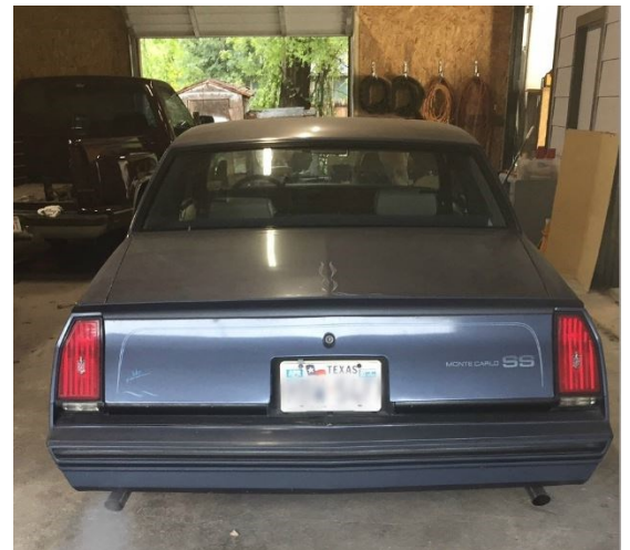
Here’s a “before” image of Gene’s 1983 SS Monte Carlo. “After” photo coming soon! You might see this one in some car shows in the future.