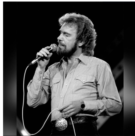
Historic images of Gene Watson are always fun to see. Gene's guess is early 1980's. What do you think?